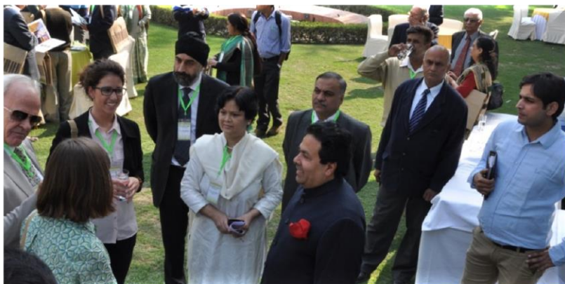
Delegates continue their discussion of the future of green chemistry with Hon. Minister of State Shri Rajiv Shukla on the grounds of the Maidens Hotel

While this may seem an inauspicious locale to host an international workshop in green chemistry (the only green to be found is in the brilliant fabrics of saris and kurtas worn by