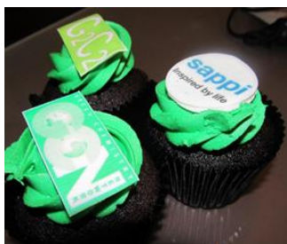
Our senses were spoiled with cupcakes bearing logos of meeting sponsors

Overall, the two day event was packed with talks about research ranging from catalysis (a lot of interest in that area!), the use of biomass for energy generation and as an energy feedstock, smart bio-based materials for energy storage, chemical capture and catalytic support. Life-cycle and techno-economic considerations were shown to have gained importance in green chemistry research.