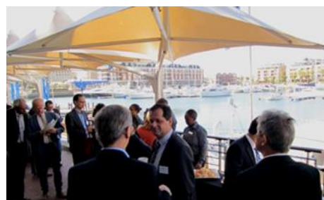
Cape Town Waterfront offered the perfect view for networking

A lot can change in 10 months in our fast-paced world. Last year, the idea of the Global Green Chemistry Centres (G 2 C 2 ) network was born, at the International Workshop on Green Initiatives in Energy, Environment and Health held in Delhi, India on 2-3 December 2013 (Report available in GCN Newsletter for January 2014, p. 7-8, see NEWSLETTER Jan 2014 )