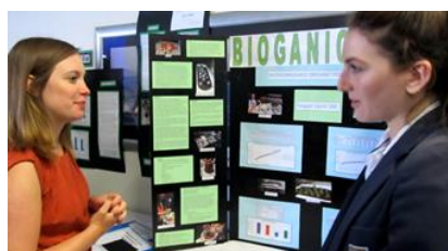
Pupils with award-winning school projects looking at waste biomass and biodiesel were given an opportunity to take part in the meeting